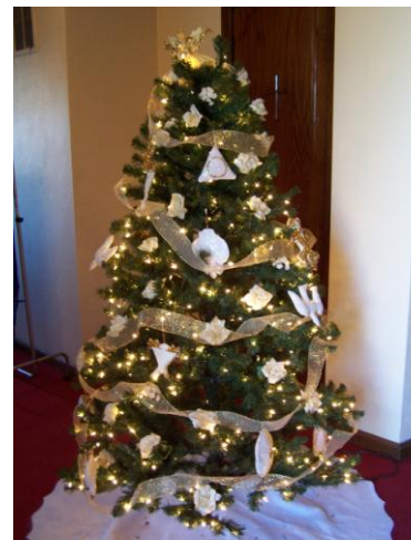
The Chrismon Tree